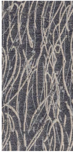
Winter Frost 03