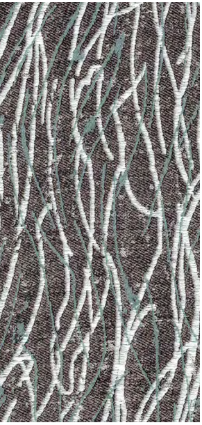
Spring Rain 01