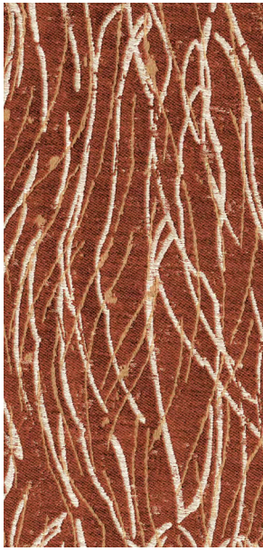
Summer Heat 02