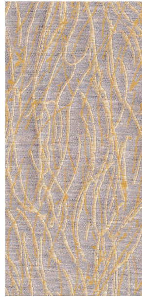
Golden Hour 04