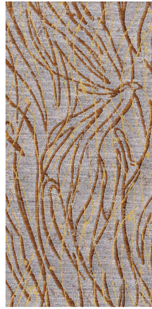
Autumn Melancholy 05