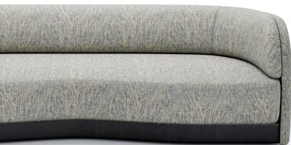
Dune sofa by Philippe Hurel Colour: Golden Hour

London's parks are famously and elegantly woven into the city's fabric: centuries-old trees offer refuge to birds that never leave the city. It was that image of the birds, always ready to soar into the sky, that found its way into Anna Agapova's drawings. These were created in the style of Jackson Pollock, the master of abstract expressionism. This pattern is a graphic expression of the ornamental lines representing the firmness and the movement of the branches and, of course, the birds taking flight.