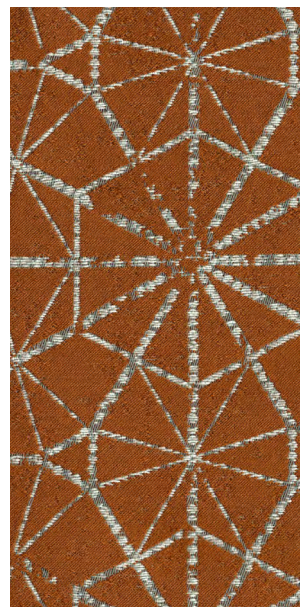
Autumn Melancholy 05