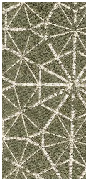
Summer Heat 02