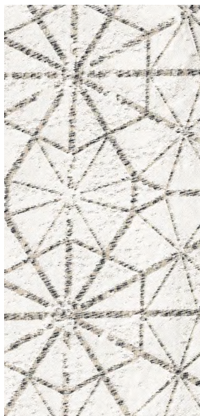
Winter Frost 03