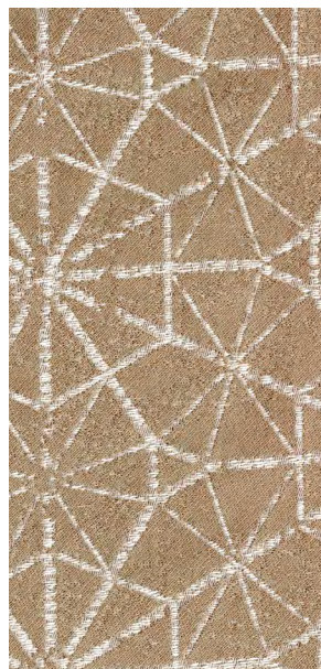
Golden Hour 04