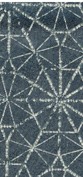
Spring Rain 01